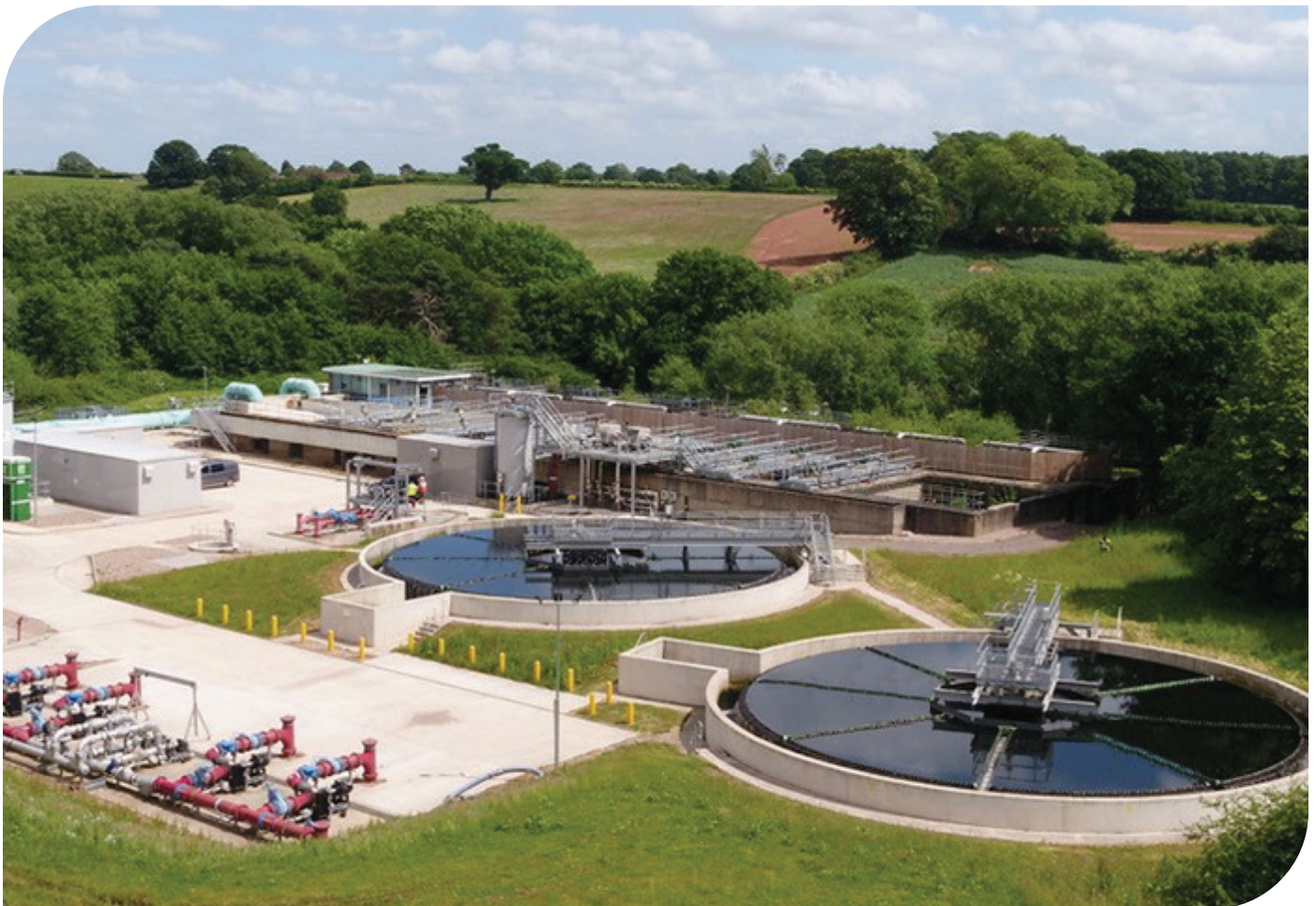
Ballasted clarification systems dramatically increase biological treatment capacity, helping meet ENR limits and produces effluent quality far superior than conventional alternatives, and at lower life-cycle costs.

Ostara's Pearl® system is a fluidized bed reactor that recovers phosphorus and ammonia from high-strength nutrient streams that include sludge, dewatered liquor,