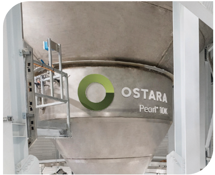
Ostara's Pearl® system is a nutrient recovery solution to help transform wastewater treatment plants into true resource recovery facilities

Crystal Green® fertilizer is only 4% water soluble versus ~90% water solubility for typical phosphorous fertilizers. This greatly reduces the runoff and leaching of phosphorous into our waterways and groundwater. The nutrients are accessible from acid release of the crop roots allowing the fertilizer to remain in the root zone longer, requiring less phosphorous application for greater crop yields.