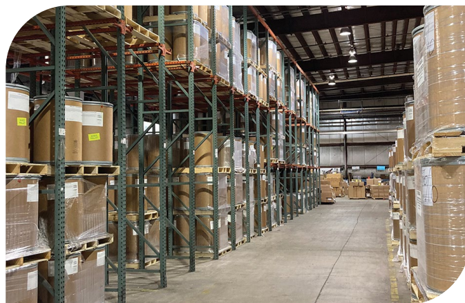
Xylem's central distribution facility in Rockford, IL

Xylem service technicians go through a formal multi-tiered training program. This ensures reliable and consistent service performance across customer sites for peace of mind.