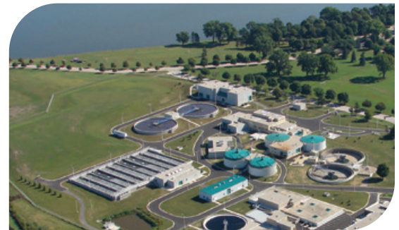
Aerial view of a state-of-the-art wastewater treatment facility, showcasing advanced infrastructure and sustainable operations.

HRSD was faced with one of the strictest nutrient discharge limits in the country: a total nitrogen (TN) limit of 3 mg/L and a total phosphorus (TP) limit of 0.3 mg/L. Achieving this level of nutrient removal required a fundamental shift in their treatment philosophy. The conventional approach of using large anoxic zones for denitrification was space-intensive and costly to build. Furthermore, the district needed a solution that could be seamlessly integrated into its existing infrastructure across multiple plants, each with unique layouts and operational parameters. The primary obstacle was to intensify the biological treatment process to remove more nitrogen in a smaller physical footprint. This meant finding a technology that could provide highly efficient mixing in anoxic zones to maximize contact between microorganisms and wastewater, thereby enhancing the denitrification process. Failure to meet the new regulations would result in significant financial penalties and environmental consequences, making the search for an effective and economical solution a top priority for the district.