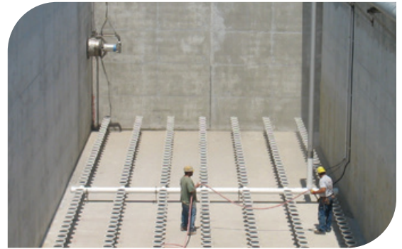
Maintenance underway in an aeration basin equipped with fine-bubble diffusers for optimized oxygen transfer and nutrient removal.

"To achieve the low effluent total nitrogen concentrations we needed, we were looking for a robust and reliable mixing system for our anoxic zones that would operate continuously."