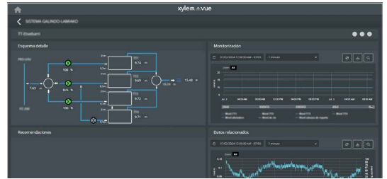
Control structure diagram and signals

“Our systems help us optimize infrastructure use during extreme rainfall and prevent overflows. By integrating AI and weather forecasting, we can make informed decisions in real time, ensuring that even the most unpredictable weather events don't overwhelm our networks.”